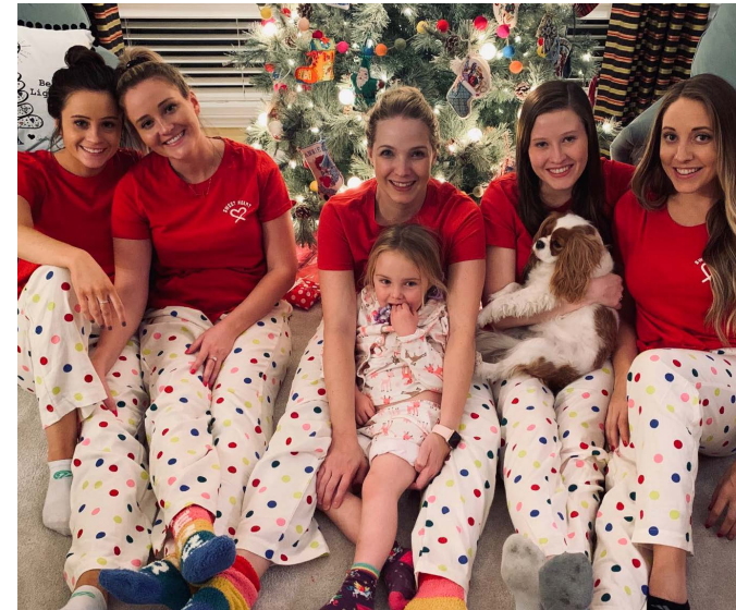
Christmas with cousins