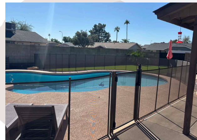
Backyard and swimming pool