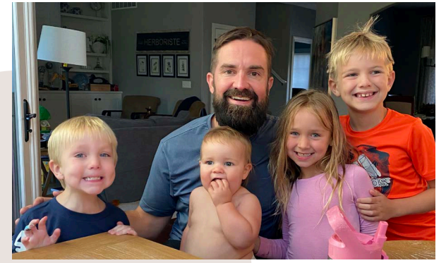
Time with cousins