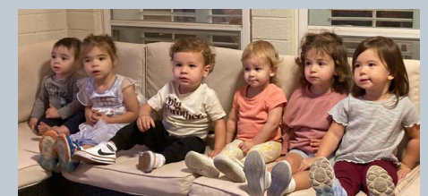
Small group kids hang