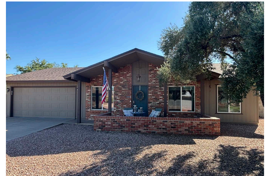
Our loving home