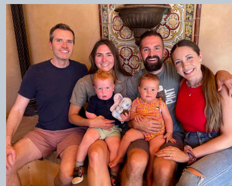
Brunch with cousins