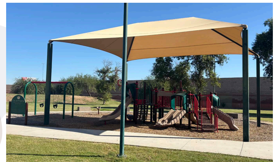
Playground we use daily