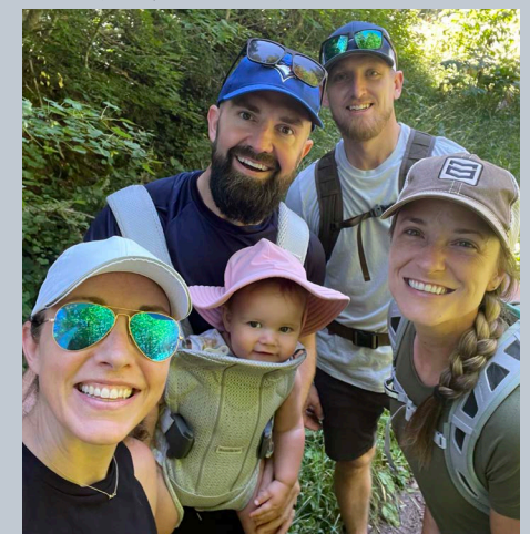
Hiking in Montana