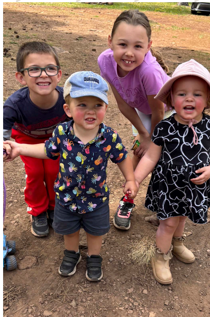
Camping trip with church group

Adoption is also deeply woven into our lives, Michael's aunt adopted two children, and many in our church have, as well. Surrounded by these examples of love and faith, we see adoption as a beautiful calling to give a child stability, and a joyful home filled with warmth, laughter, and faith.