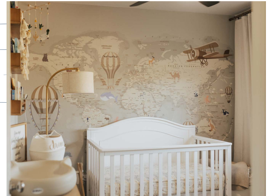
Nursery ready, hearts waiting

We live in Arizona in a cozy, family-friendly, and culturally diverse neighborhood filled with parks, walking paths, and other young families. Our home is full of love and laughter, with space to play, relax, and grow. We have a nursery ready and waiting – travel-themed to reflect something we value deeply as a family: exploring the world together and appreciating different cultures. We can already picture our future child in this space, surrounded by warmth, adventure, and love. Our backyard has both a pool and a grassy area – perfect for learning to swim, playing, and enjoying sunny days together.