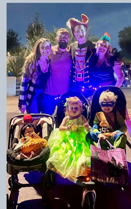
Dressing up with kids

We're surrounded by an incredible group of friends who truly feel like family. Many are lifelong friends or cousins who have walked through life with us, and others we've met through our wonderful church community. Many of our friends have adoption as part of their family story, creating a loving and supportive environment where it's deeply valued. Weekends often include playdates, game nights, and pancake breakfasts filled with laughter.