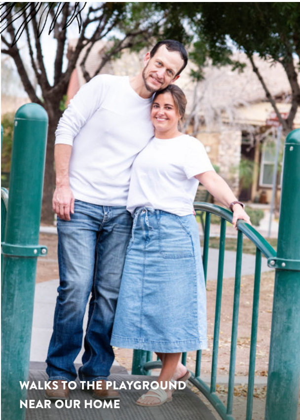
WALKS TO THE PLAYGROUND NEAR OUR HOME