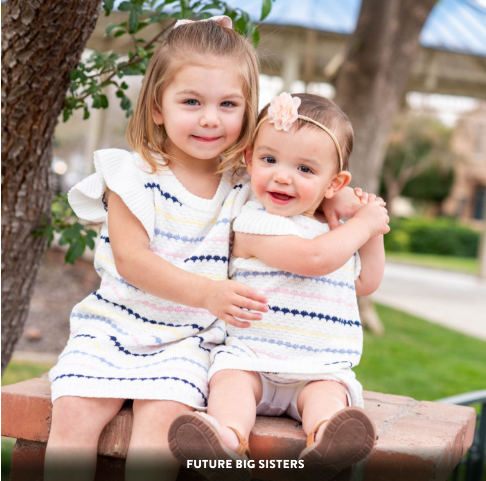
FUTURE BIG SISTERS