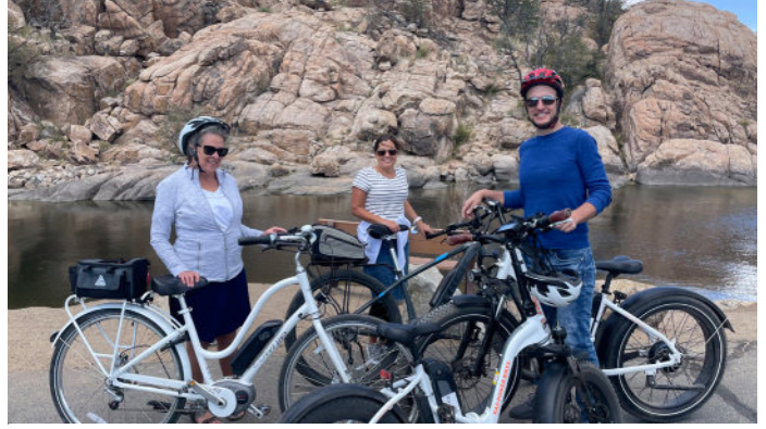
BIKING WITH A FRIEND