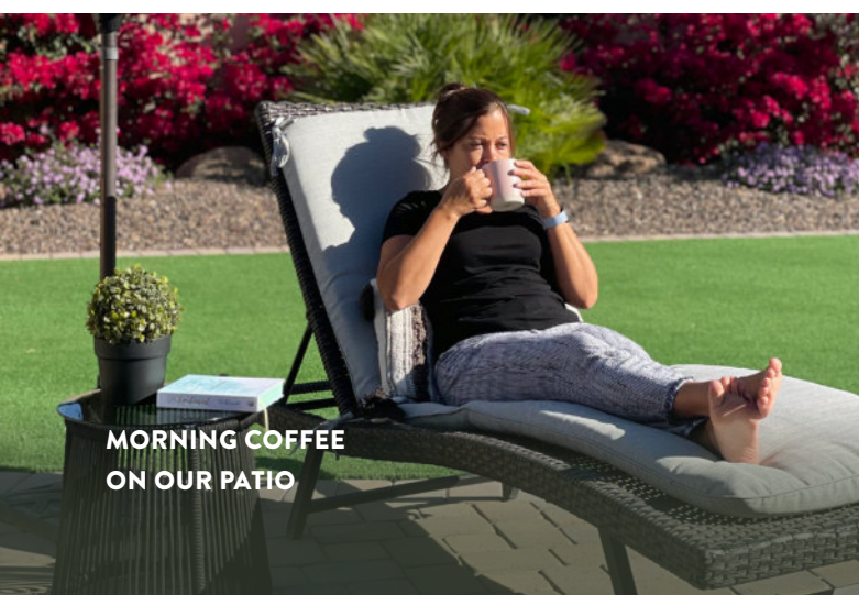
MORNING COFFEE ON OUR PATIO