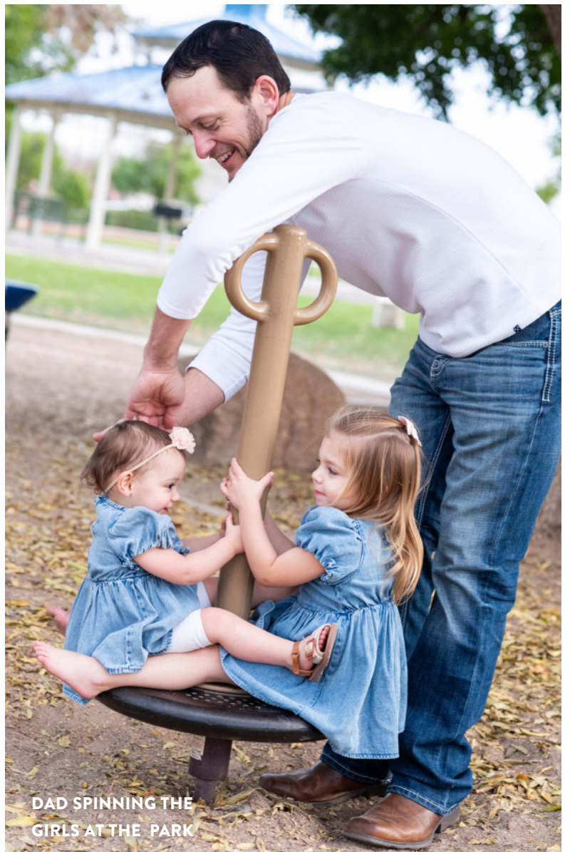
DAD SPINNING THE GIRLS AT THE PARK