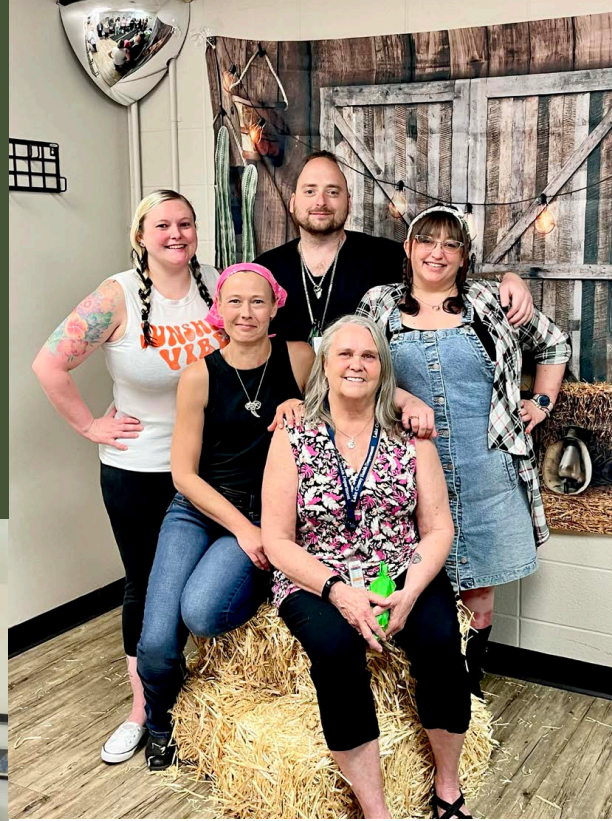
Mom's retirement hoedown