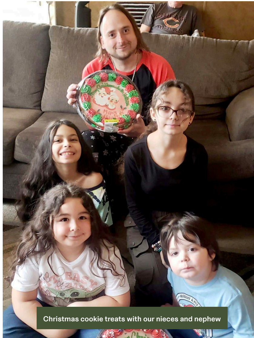
Christmas cookie treats with our nieces and nephew

With both sides of our family, we frequently enjoy casual get-togethers or conversations, along with huge holiday celebrations, family parties, family vacations, and family reunions.