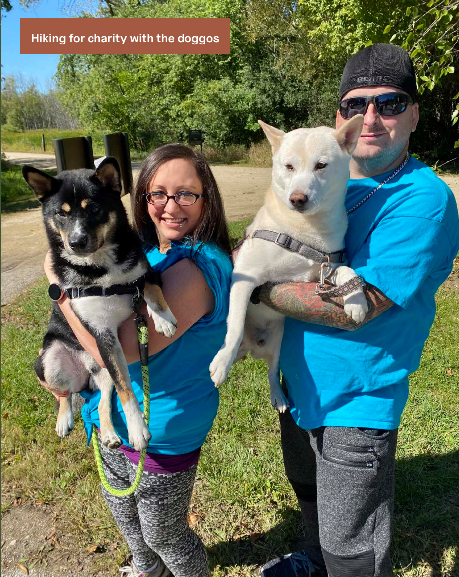
Hiking for charity with the doggos

Kuma is a 10-year-old "puppy." He is a loving and persistent boy with a soul piercing stare. He loves belly rubs, being chased, car rides, walks and hikes, and getting his way. Loki is the 4-year-old baby "smol dog," even though he's not much smaller than Kuma anymore. He is one of the chilliest, yet also most stubborn, dogs you will ever meet. He loves being outside, food/treats, toys (especially balls), following around his "hoomans," and exploring new places. Both are very well-behaved, are bonded deeply with each other and their people, and get along great with children.