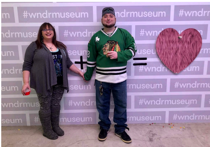
Showing our love at the WNDR Museum in Chicago

True love, humor, mutual values, and shared joys make us a wonderful match and team. We choose each other every day, and always will.