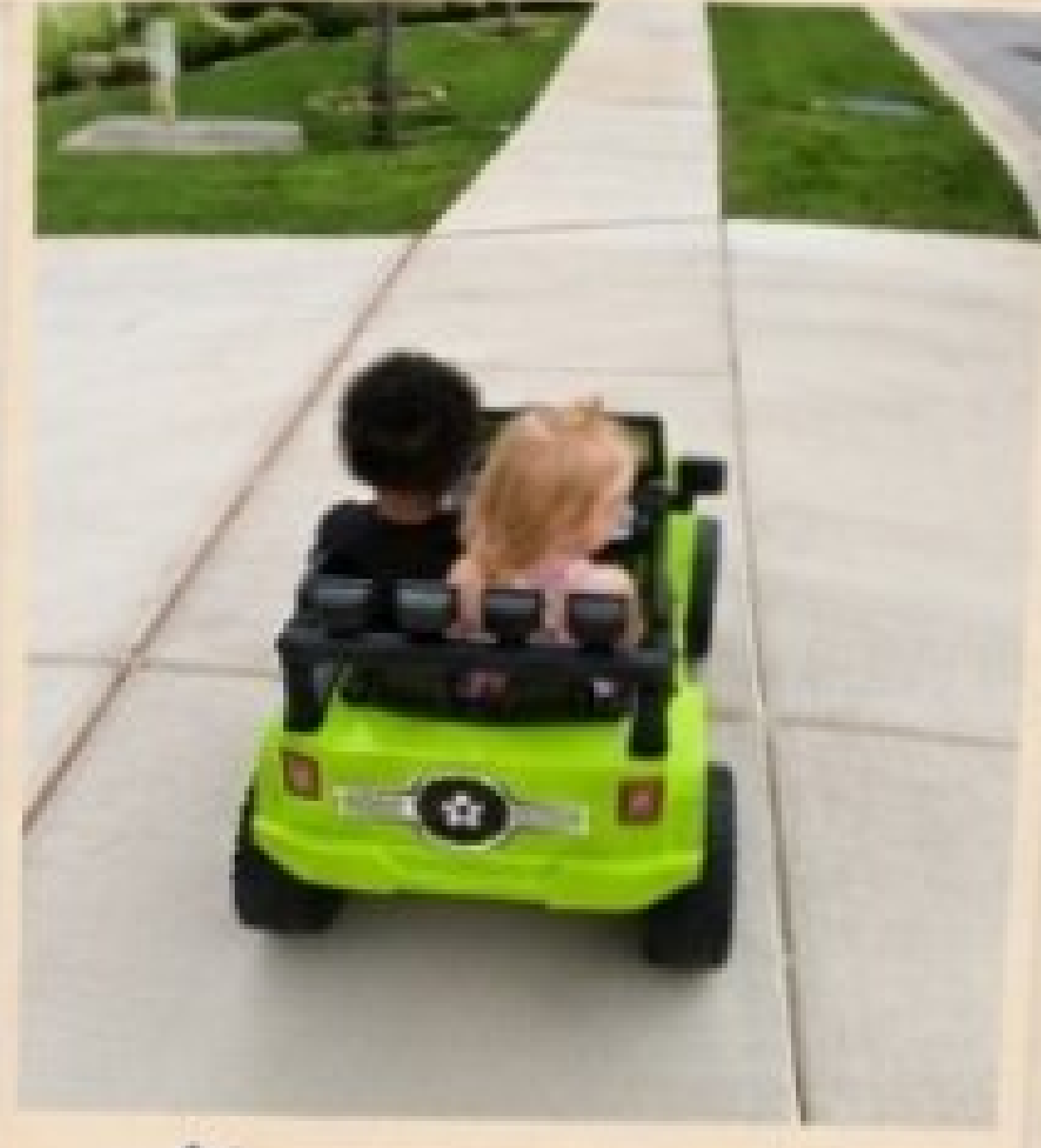
Adventures together ♥