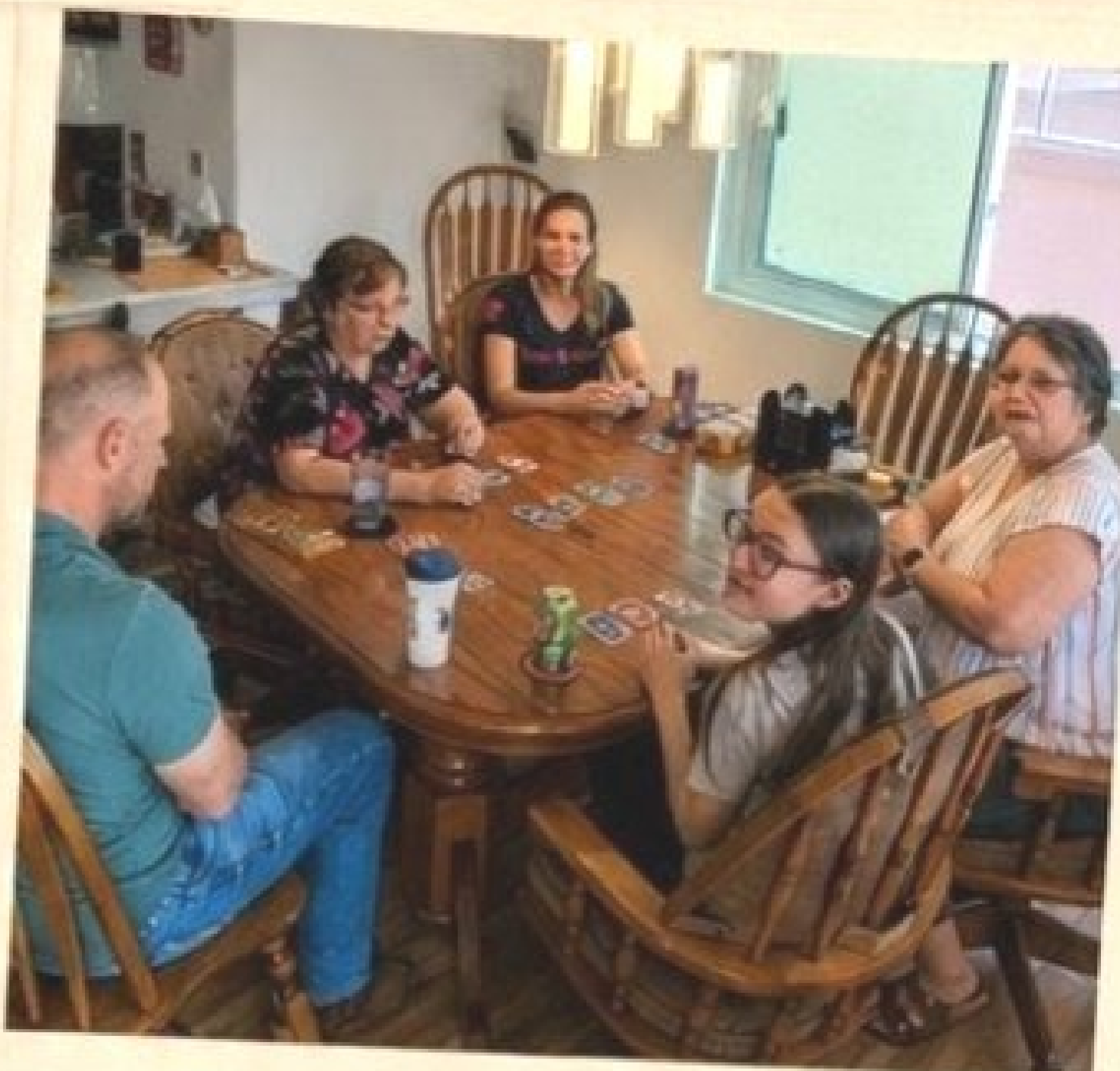
Treats & good times ♥