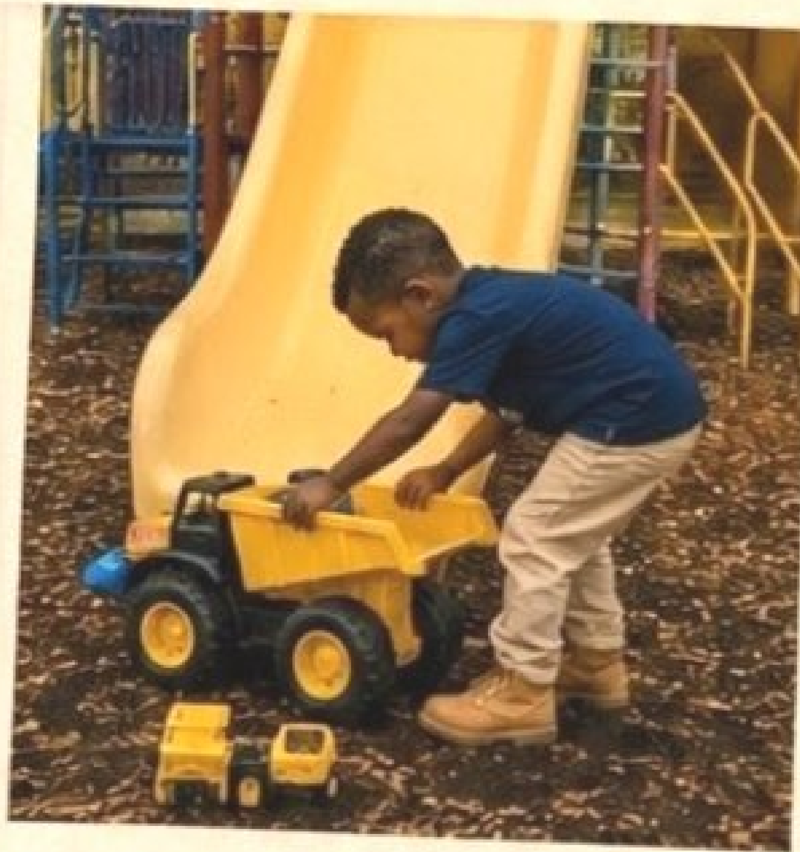
Big toys & big imaginations ♥