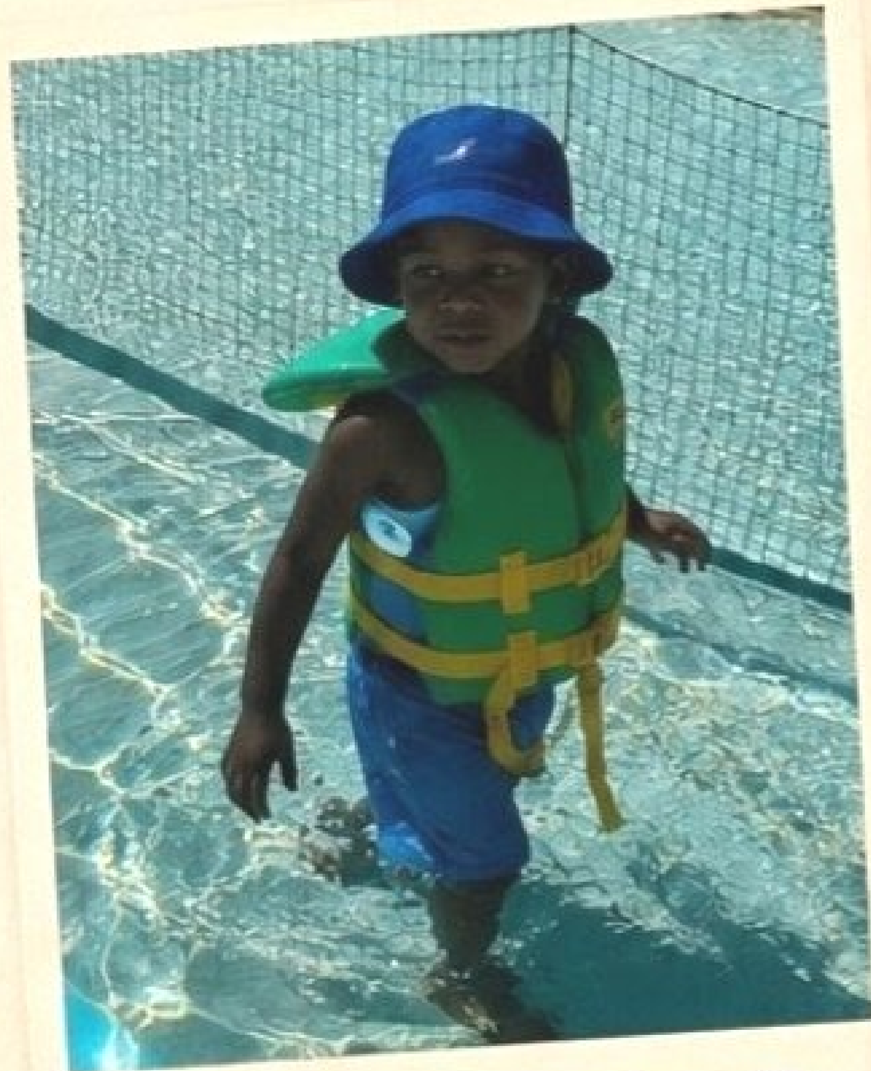
Pool days & sunshine ♥