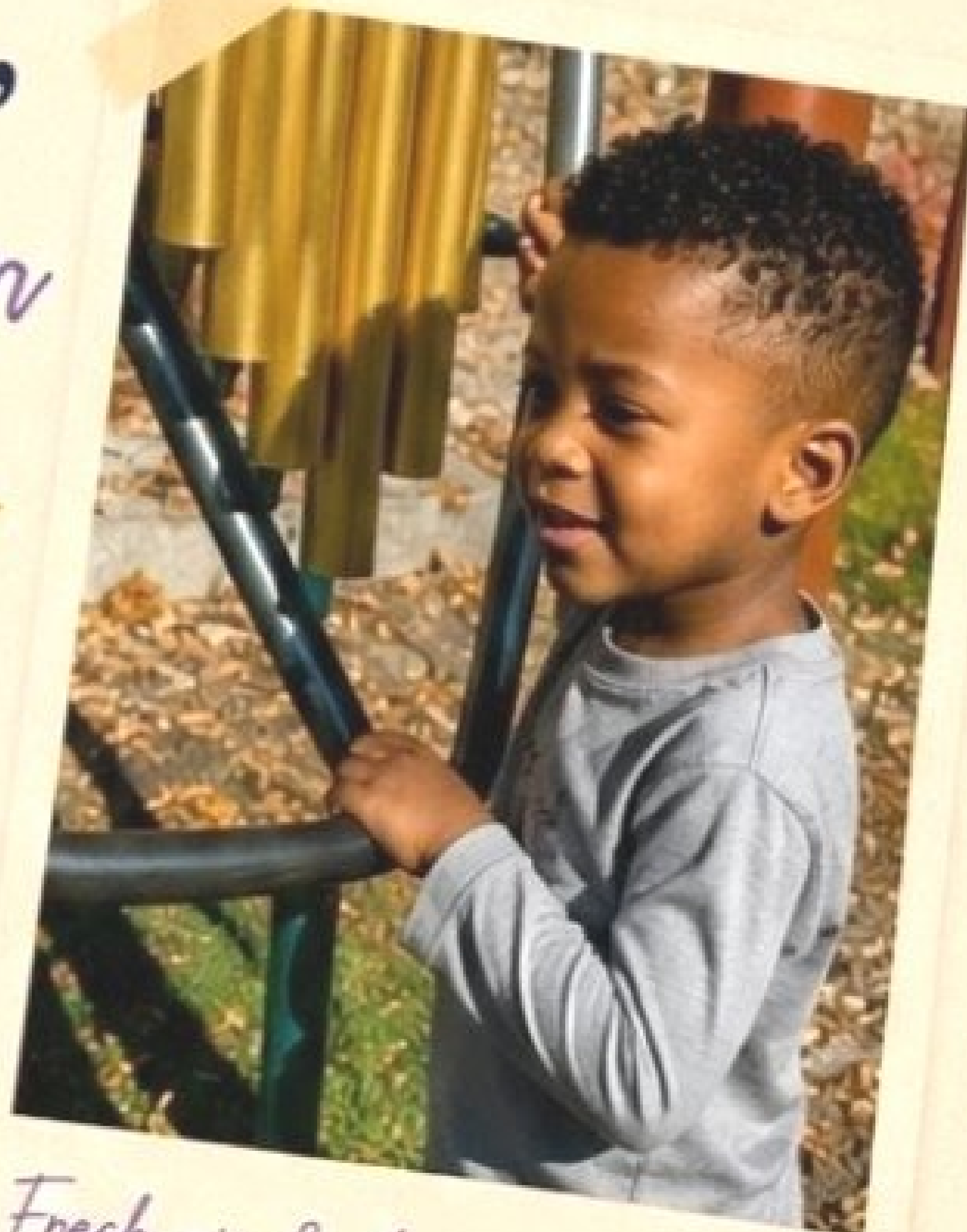
Fresh air & playground fun ♥

Weekends are our favorite— a time to slow down, connect, and make memories that last a lifetime.