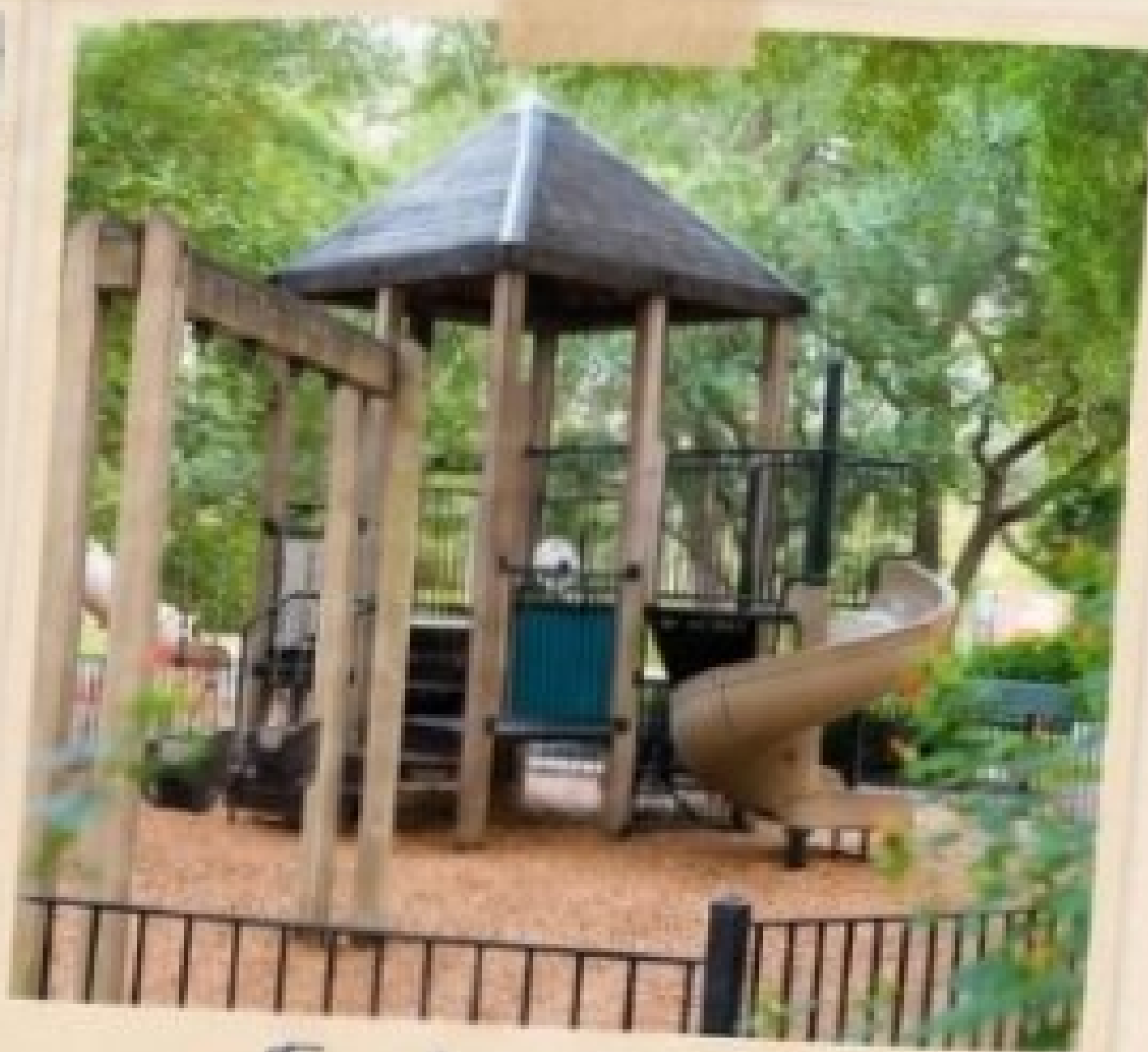
Fun close to home ♥