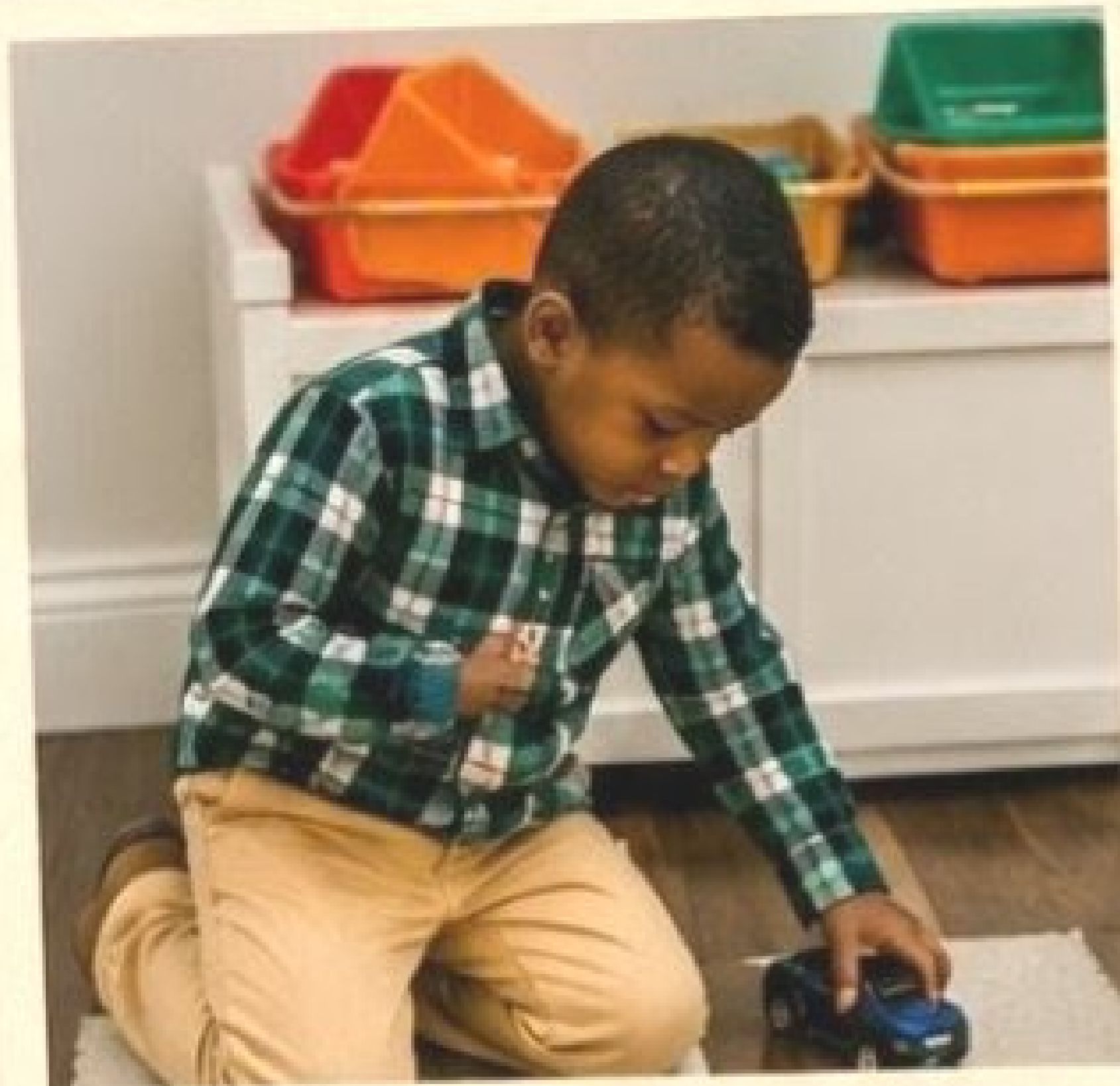
Creative & play time ♥