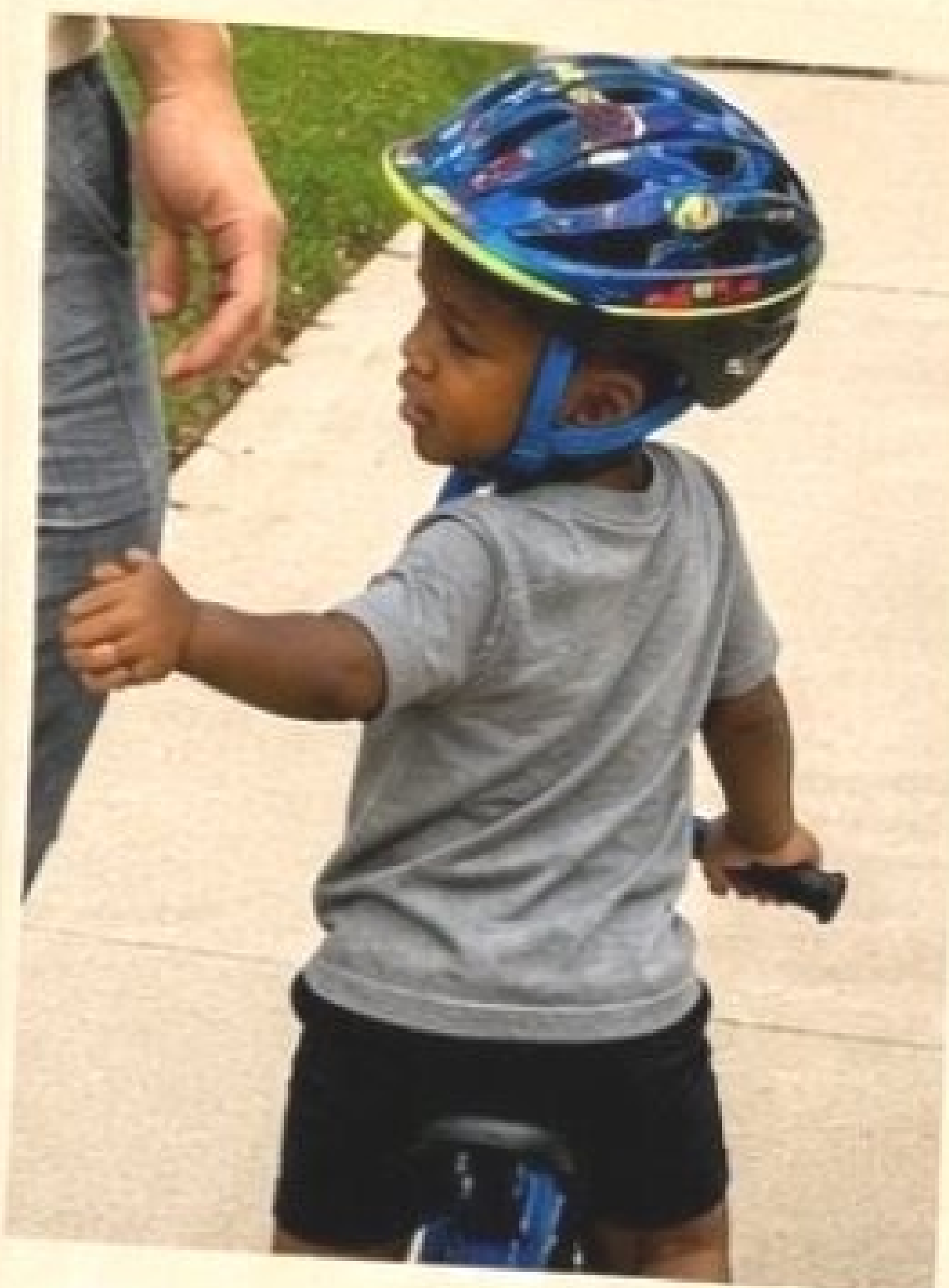
Bike rides & fresh air ♥