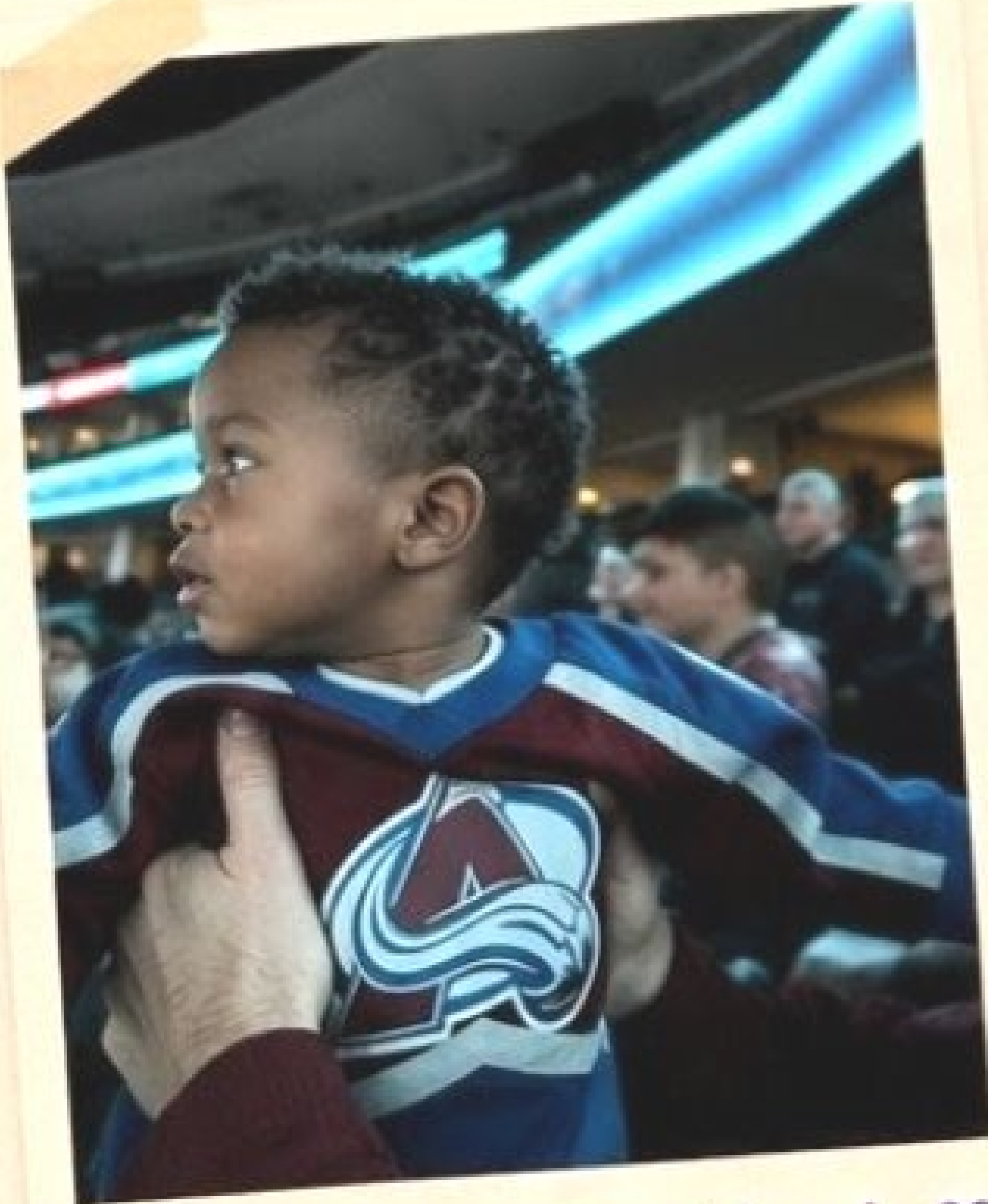
Game nights & lots of laughs ♥