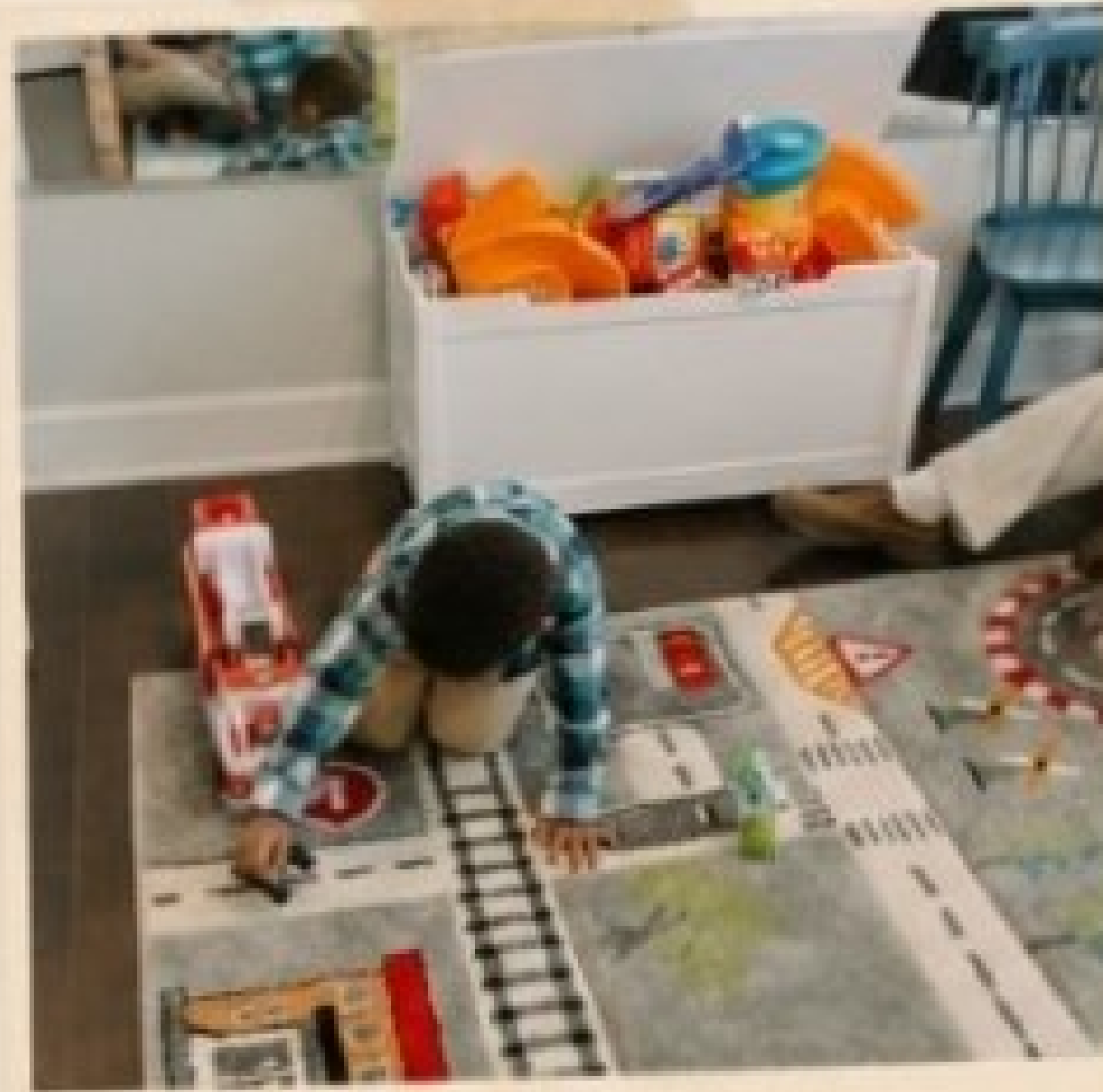
A place to play ♥