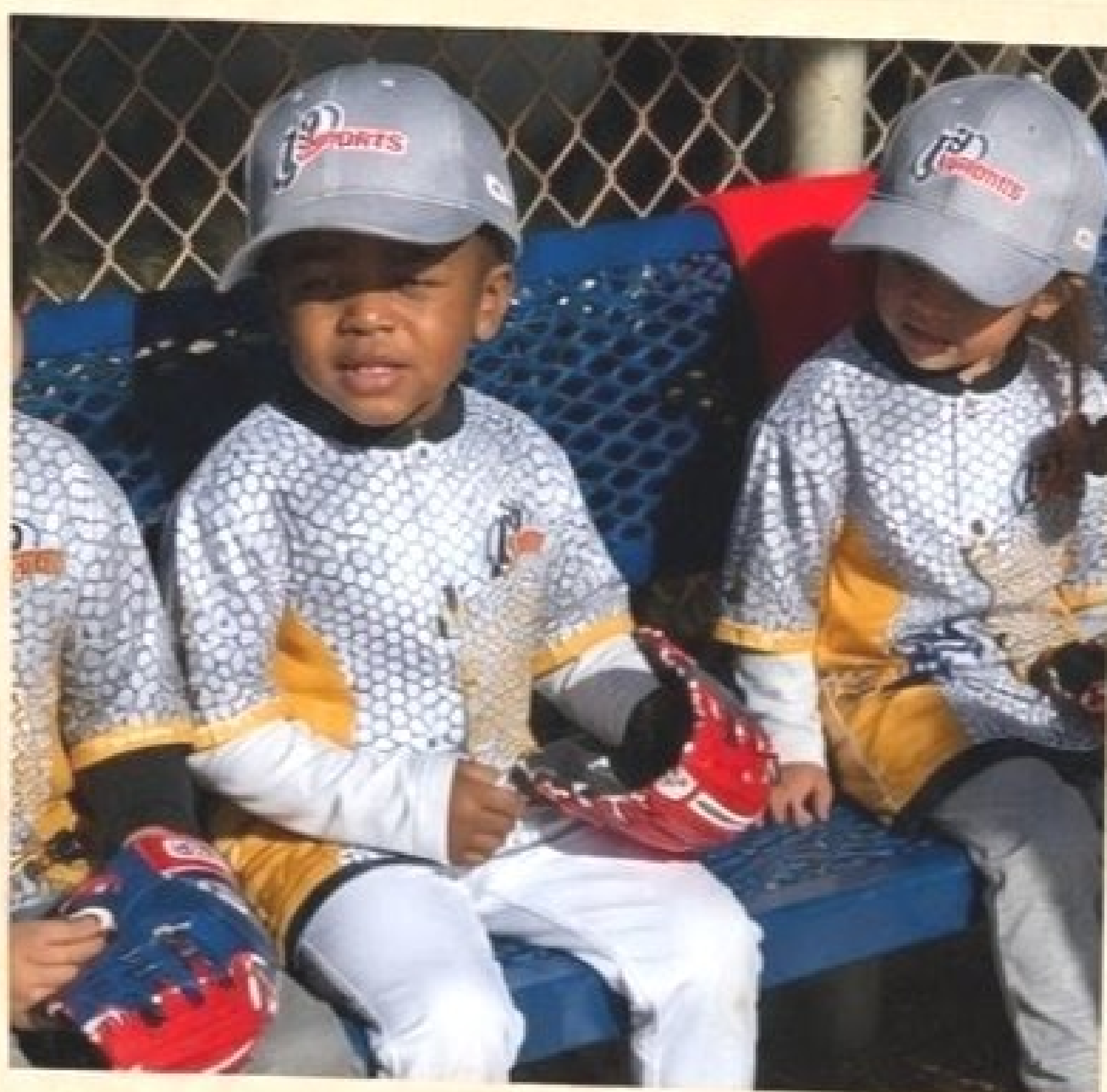
Team games & cheering loud ♥