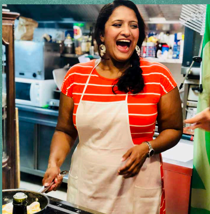
I'M HAPPIEST WHEN COOKING FOR THOSE I LOVE

It's a beautiful tradition that is drawn in one's house to welcome the Goddess of Wealth. Initially, I took this up as a casual hobby by starting to make simple designs with turmeric, chili powder, and salt. Gradually I started making more complex designs with professional sand that I got from India. Finally making designs as big as 5x5ft (with the help of my sister) which would take over 24 hrs to make. This was a highlight in the community, as the scale of something like this is not seen here in America, so it was a sweet moment I was able to give to my community. My love for art is reflected throughout my house. I especially love to display local art and highlight local artists, the paintings are a true reflection of me, my experiences or my humor.