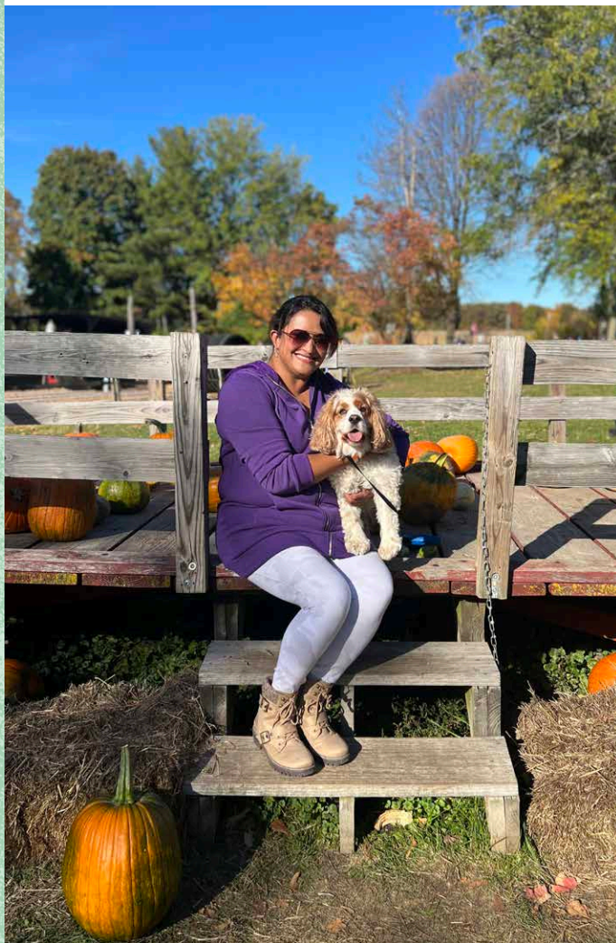
VISITING A PUMPKIN PATCH IN THE FALL HAS BECOME AN ANNUAL EVENT FOR US