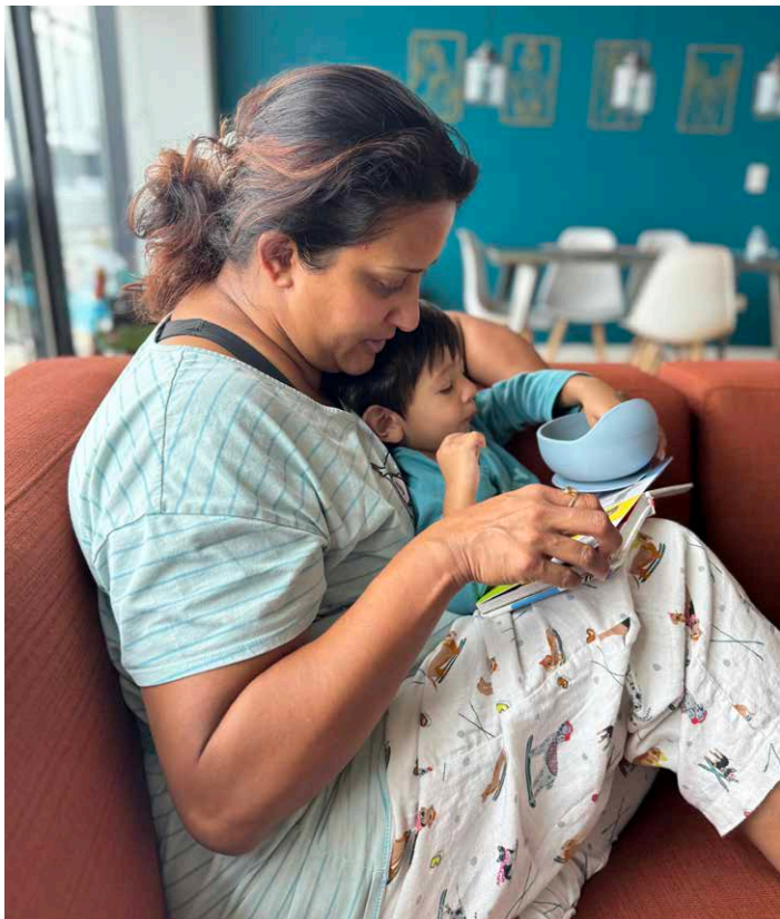
MORNING CUDDLES WITH MY FRIEND'S MUNCHKIN