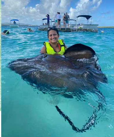
I WAS SO SCARED BUT WAS PROUD I HELD A STINGRAY