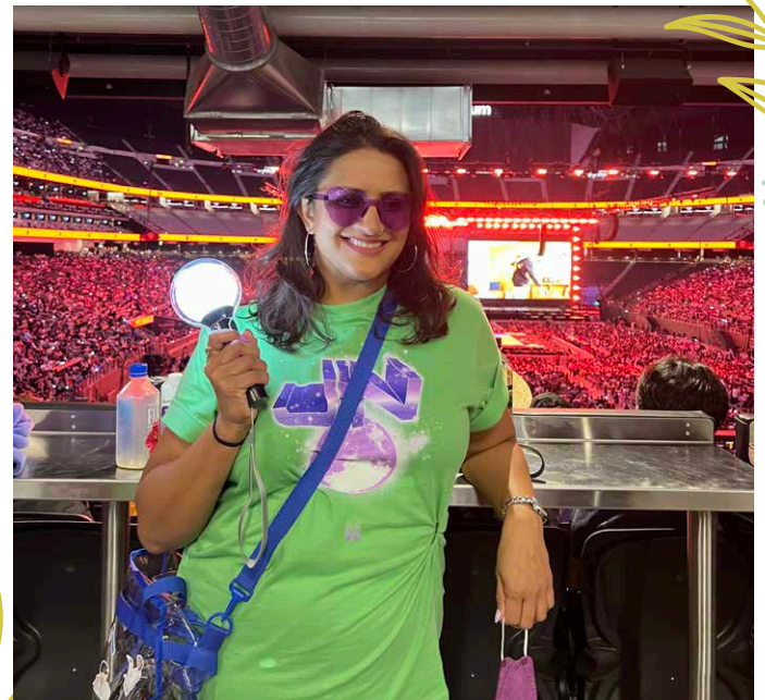
AT MY FIRST BTS CONCERT!