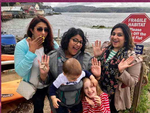
GOTTA EMBARRASS THE KIDDOS!

My father IS A VERY GREGARIOUS AND A POPULAR PERSON,