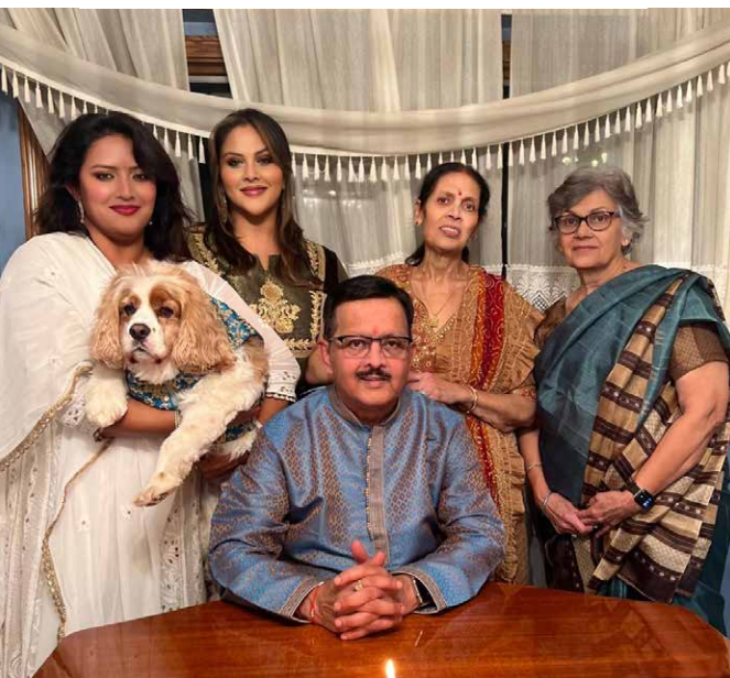
FAMILY PIC WITH MY ELDER AUNT FOR DIWALI (OUR NEW YEAR)

however, we have a very large extended family all across the US and in India. While growing up, it was very common for us to visit family in India or different parts of the US. I grew up with my cousins and can't wait for my child to have the same experience, playing with them and being spoiled by all the aunts and uncles.