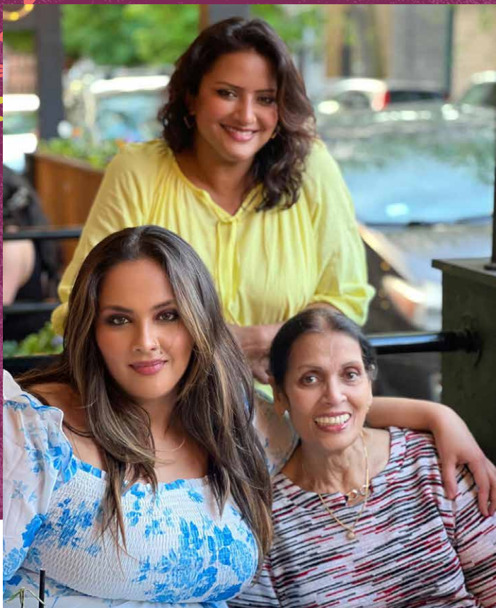
MOM, SISSY AND ME