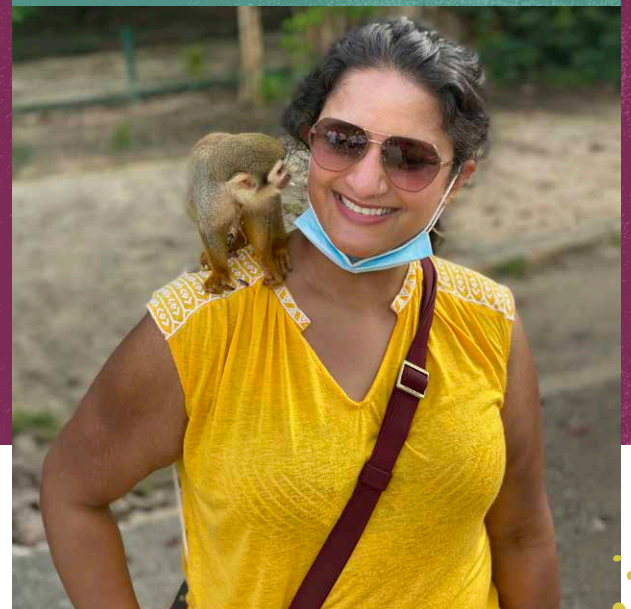
THIS LITTLE MONKEY GOT ON ME AND PROMPTLY TRIED TO STEAL THINGS FROM MY PURSE!

HOBBY: I have a great love for books. I remember waking up to a new book by my bedside when I was young, a gift from my parents. I always found books to be a great escape where I could explore new worlds and I wish the same for my child.