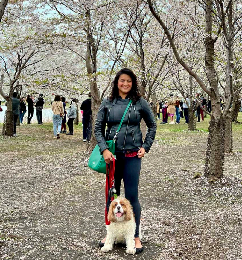
SEEING THE CHERRY BLOSSOMS IS A YEARLY TRADITION