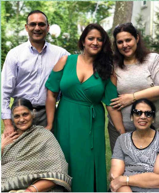
FAMILY FROM MY MOM'S SIDE AT MY NIECE'S GRADUATION