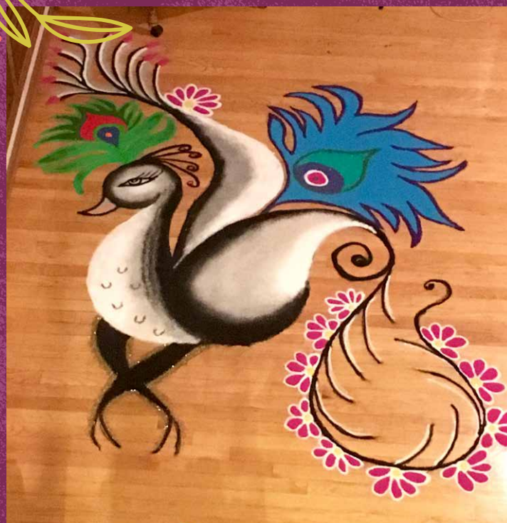
ONE OF MY RANGOLI DRAWINGS

I have a love for creating dishes from diverse cuisines and also enjoy baking. Currently, I'm focusing on mastering Korean cuisine. I've catered events for up to 3000 people with my family, and I can confidently prepare meals for 100 individuals on my own. Food is central to my life; for me, it's a powerful expression of love, and I cherish cooking for those close to me. Through my travels, I love trying new cuisines and often find that food is a lovely common language through which I can connect with people of all cultures. I would love for my child to learn how to cook as well.