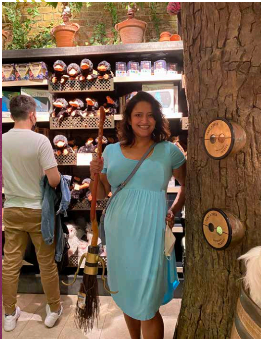
I'M A BIG FAN OF HARRY POTTER!

IF I WERE TO summarize MYSELF IN A FEW WORDS, I WOULD CHOOSE